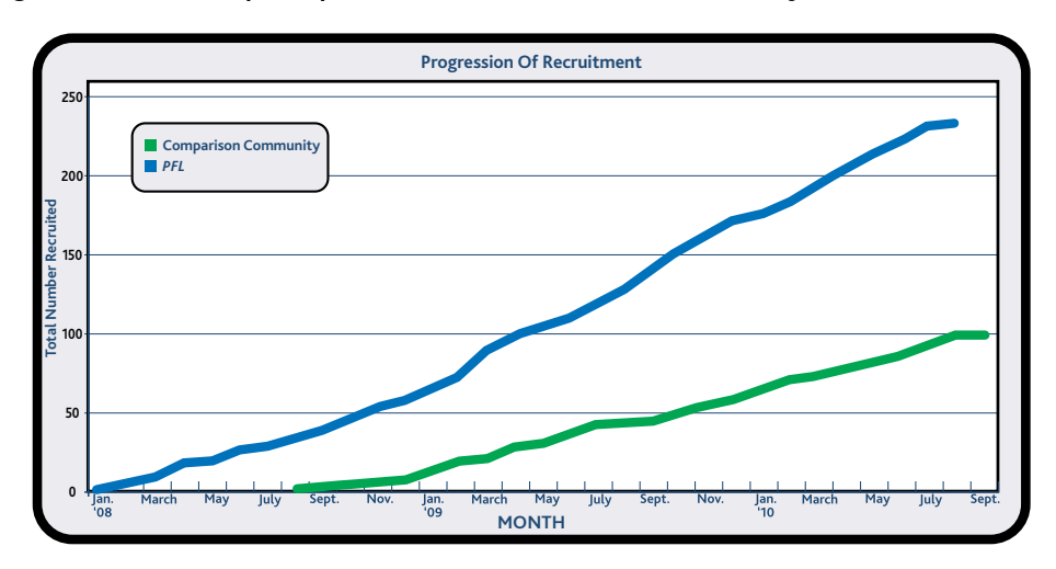
Figure 2.2. Aggregate total of participants recruited into the PFL Evaluation throughout the recruitment phase.